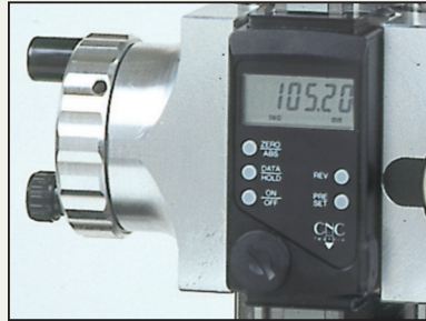
Proven measuring system from Mitutoyo with digital data output.