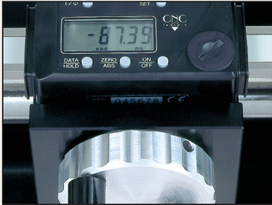
Easy operation via handwheel with delicate adjustment.

The BWTCompact also offers an optimal price performance ratio with its unique design.